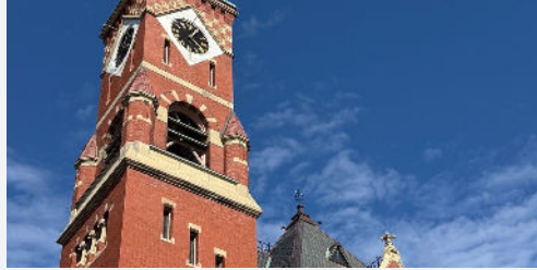
Abbot Hall - historic town hall & home of The Spirit of '76