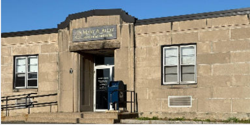
Mary A. Alley Municipal Building - 14 projects completed

The Town owns and maintains 20+ municipal buildings. This document outlines FY2027.